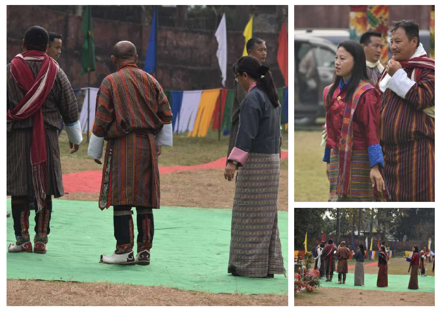
Trashi Labay by the heads, gups and dancers