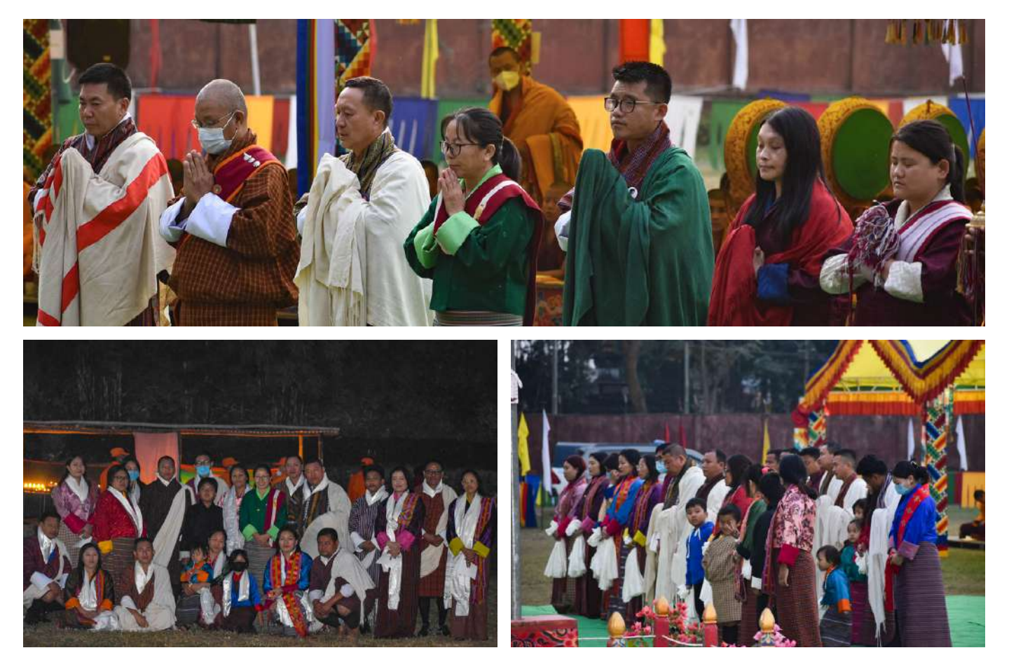
Merit dedication by the devotees from many locations.