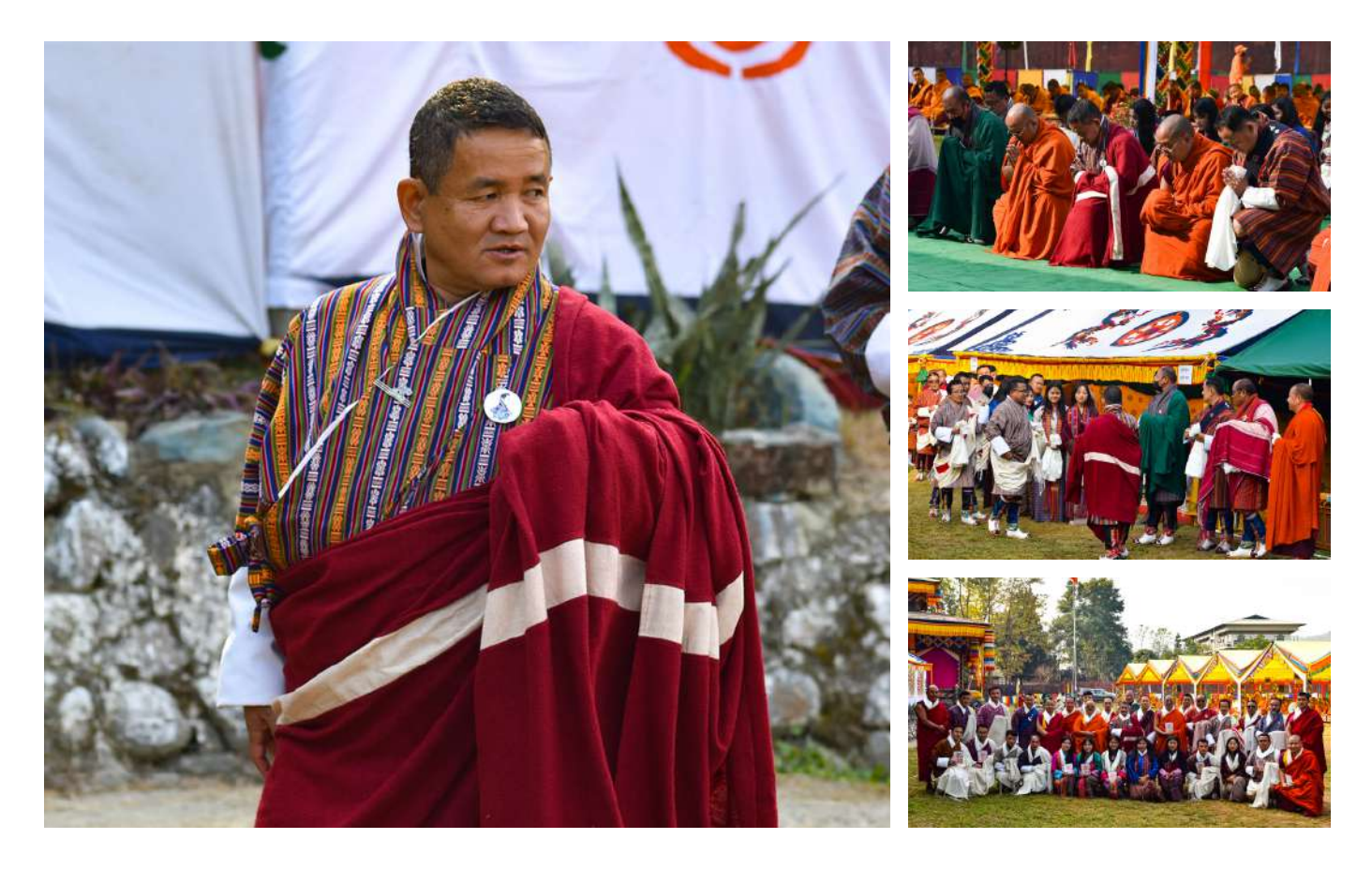
Visit by Moelam Chenmo Committe, Tashigang Dzongkhag