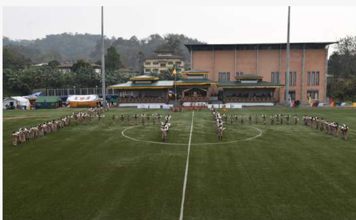
Cultural Programs by Dz. Cultural Dancers and Schools