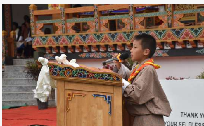
Delivery of Speech of Gratitude by the School Students