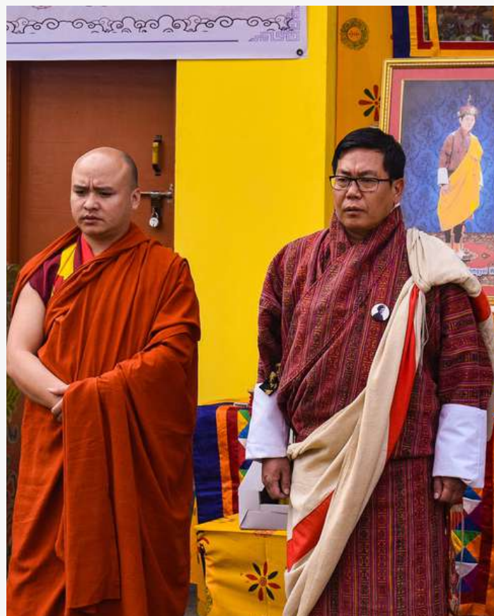
Ushering Chief Guest to the main event ground.