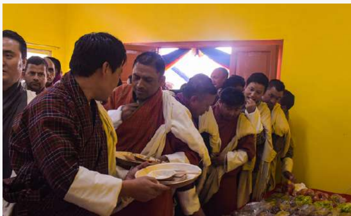
Guests and people visiting the stalls around.