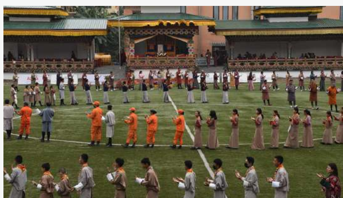
Trashi Laybay performed by guest and the people.