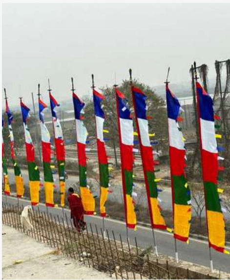
Hoisting of prayer flags at the Bhutanese Temple at Guwahati to mark the 44th Birth Anniversary of His Majesty.