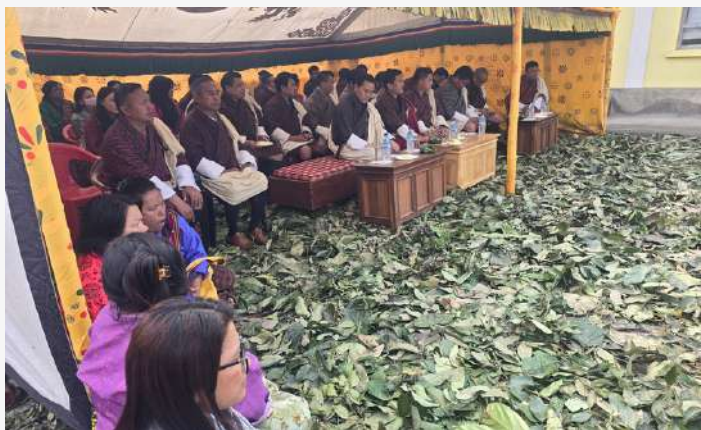
Address by the Chief Guest on the RNR exhibition theme.