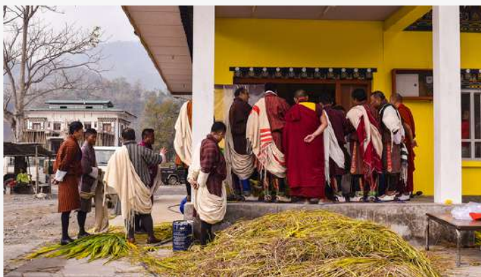
RNR exhibition inaugural and commencement.