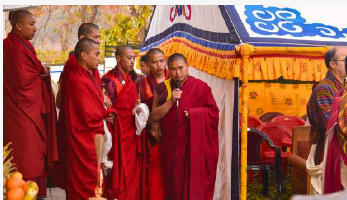
Marchang Offering Ceremony by Phuntshothang Gup