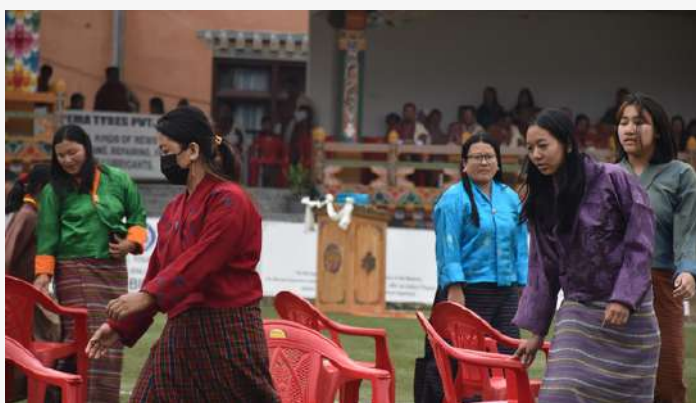
Games played among students and women, and prize award